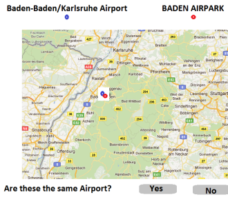
Figure 3: Interface for the identity resolution task generated from SPARQL descriptions

on existing technology. 8 This is a significant advantage of the Linked Data nature of the data sets being subjected to crowdsourcing in this approach, whereas questions related to the optimal phrasing of the task require verbalization techniques to provide a human-readable interface to graph-based data which is intended, at least in its original form, to machine-only consumption [3].